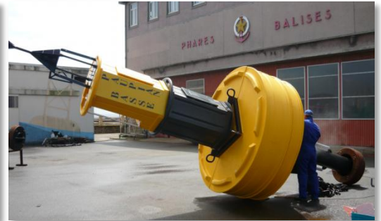
2400 – 5Q – HVPE version

The aluminium superstructure is protected against corrosion by a marine paint system. The finishing color is in conformance with IALA recommendations.