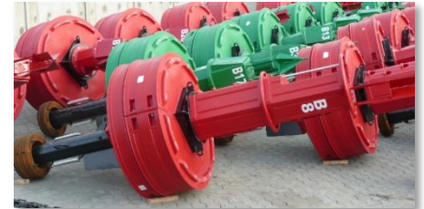
GBM2400 – 5Q HVPE – Tail version

Based on the 5m 3 volume float, several models are available, with superstructures in aluminium or in polyethylene and ballast support with different lengths.