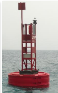
2400 – classic Alu version