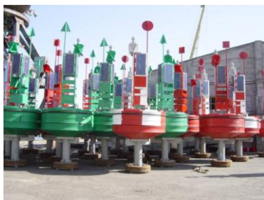
GBM2400 – 5J – Skirt keel version

Two types of steel ballast supports can be supplied, depending on the site conditions: “G” type tail or “J” type skirt keel version. The tail ballast support version is equipped with a drift which improves the buoy sea keeping. All the ballast supports are protected against corrosion with an appropriated marine paint system. Two anodes are fitted to protect the ballast support and the first 5 meters length of the chain against corrosion.